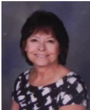
2009-10 School Year

When you retire, what is one thing you will miss about working at Germantown? I will miss the children of Germantown. I will miss their smiles, excitement, and the pleasure of helping each one of them grow both academically and socially.