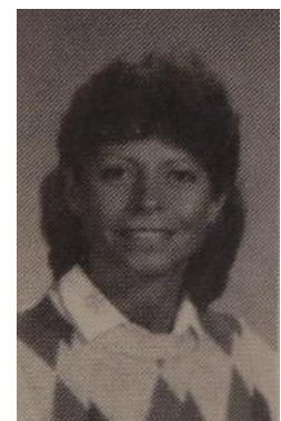
1987-88 School Year

It is the little things that mean a lot, so in keeping with that, how are you able to "be there" for the students and your colleagues? With the staff, it is easy. We have a staff that is like a family, and we all step up to support and help each other. With the students, I feel that sometimes a smile, a hug, or a joke can turn around a child's day.