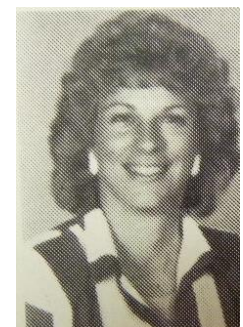
1985-86 School Year

If someone wrote a biography about you, what would the title be? You're Not Living if You're Not Having Fun!