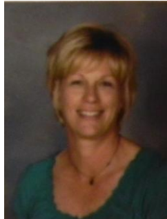
2009-10 School Year

When you retire, what is one thing you will miss about working at Germantown? Other than the kids, I