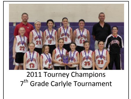
2011 Tourney Champions 7 th Grade Carlyle Tournament

the Regional championship game to earn a berth in the State Tournament at Rend Lake. Their first round game will be held on Saturday, January 21, at 2:30 against St. Mary's Mt. Vernon.